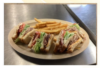
1637 N Cocoa Blvd. Cocoa Open 7 Days 7am-2pm Great breakfast and lunch options - food is delicious!