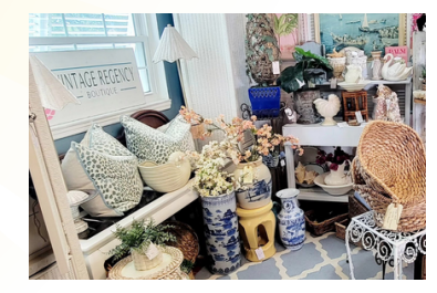
625 Florida Ave. Cocoa Closed on Mondays A variety of booths with treasures to be discovered!